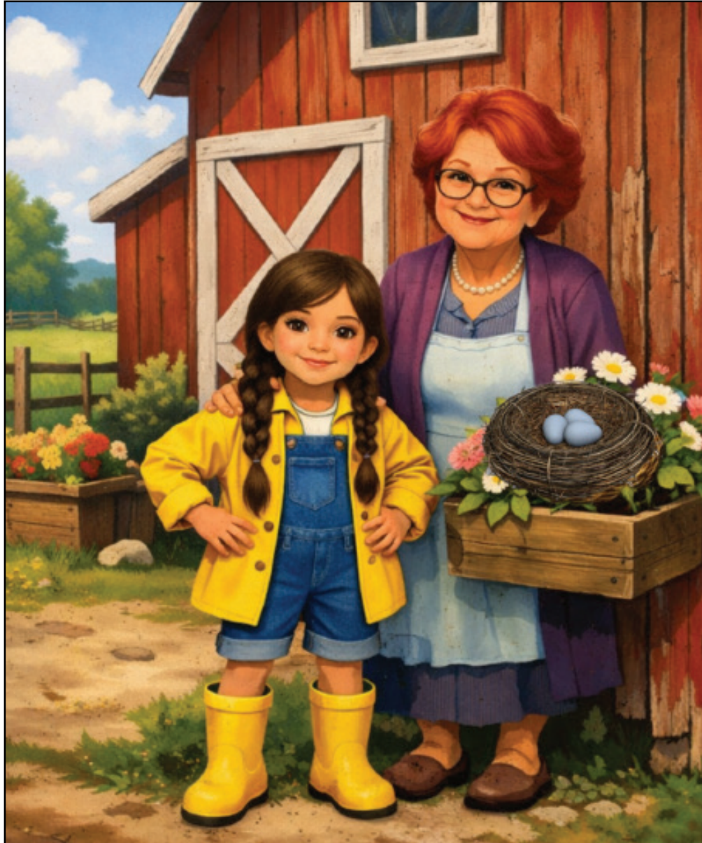
AI Generated Image